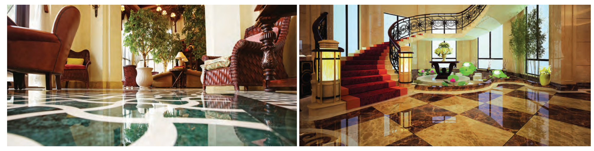
If a cleaning product was not specifically formulated to clean while NOT interacting with the chemical makeup of the stone, assume it is not safe to be used—period. Ask us for recommendations of products.