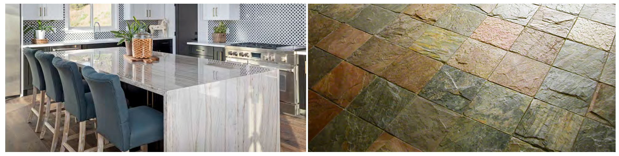
Even the most delicate, acid-sensitive stones can be used in kitchens and baths with today's state-of-the art protection treatments.