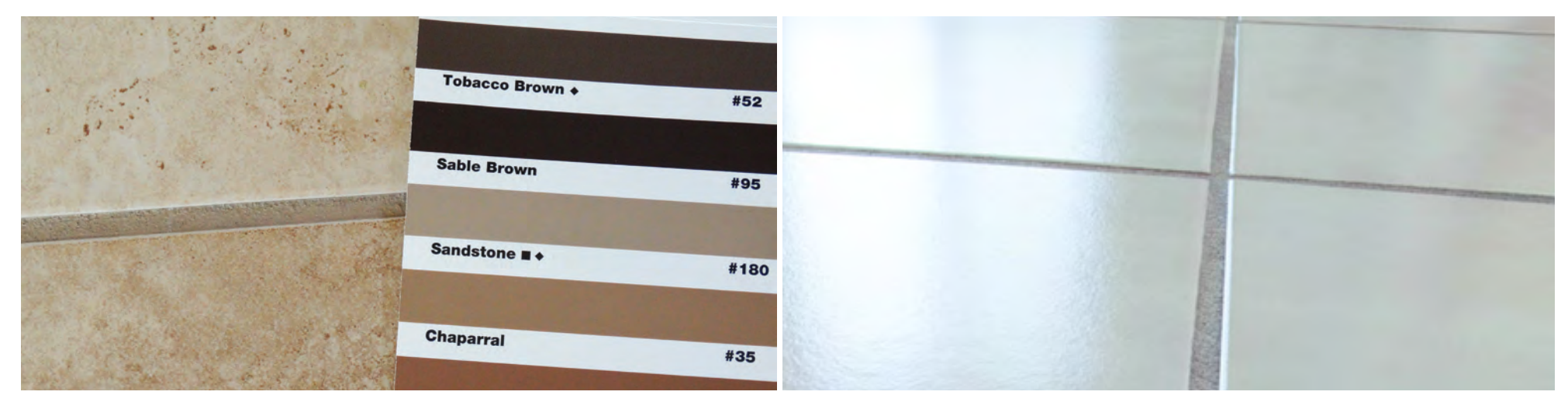
With grout color sealing you can change the color of your grout, even from dark to light, with years of protection from stain, mold and mildew growth.